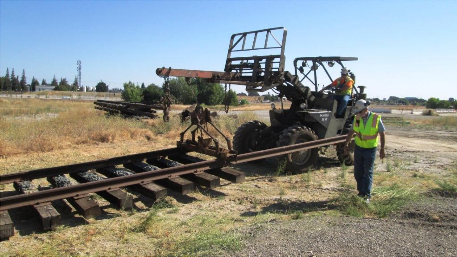
Alan guides the first panel into position