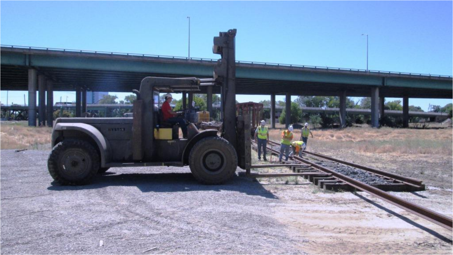
Simba can lift the equivalent load of six Big Green Machines