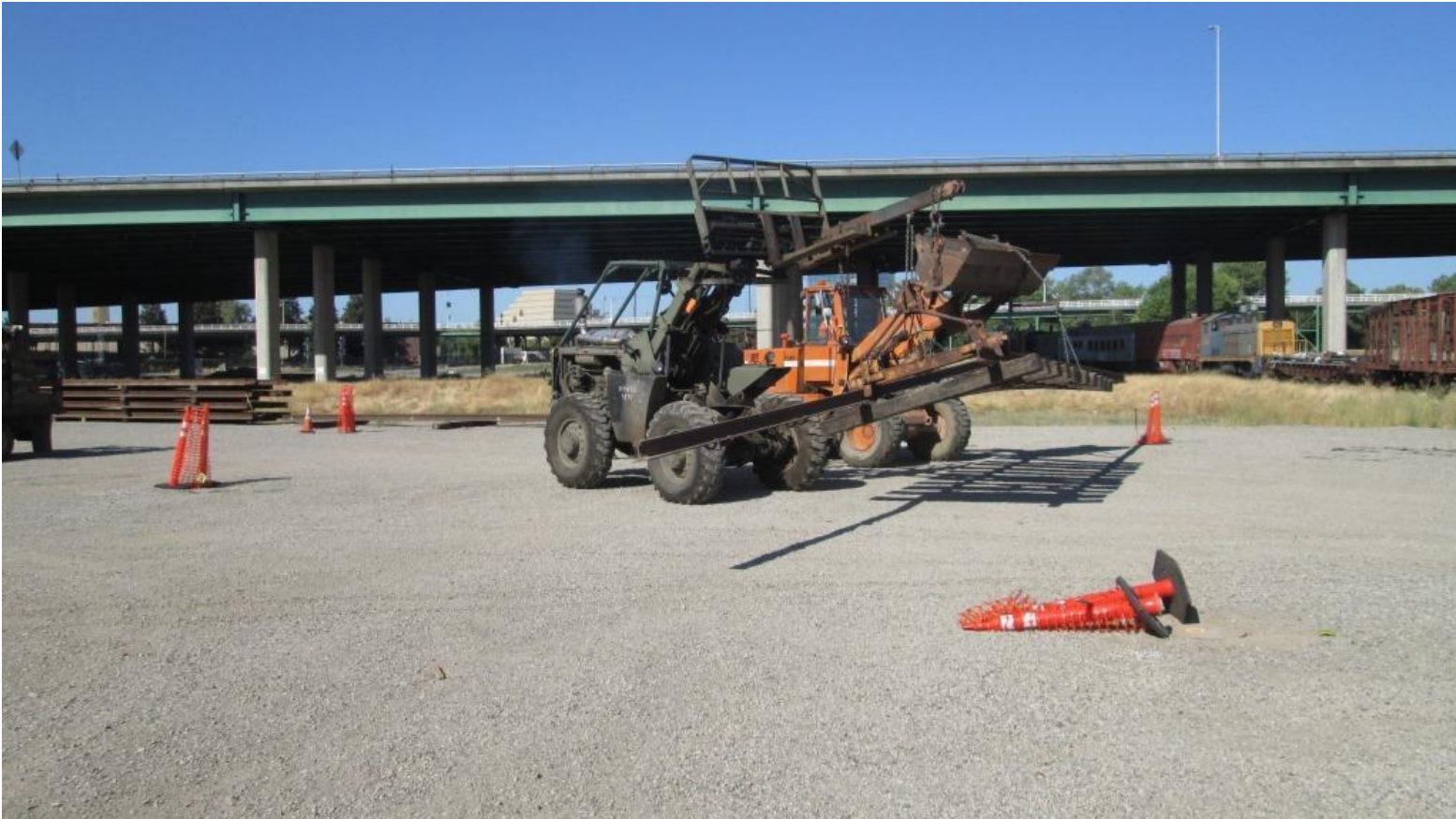
It took a great deal of skill, communication, and patience to make this move