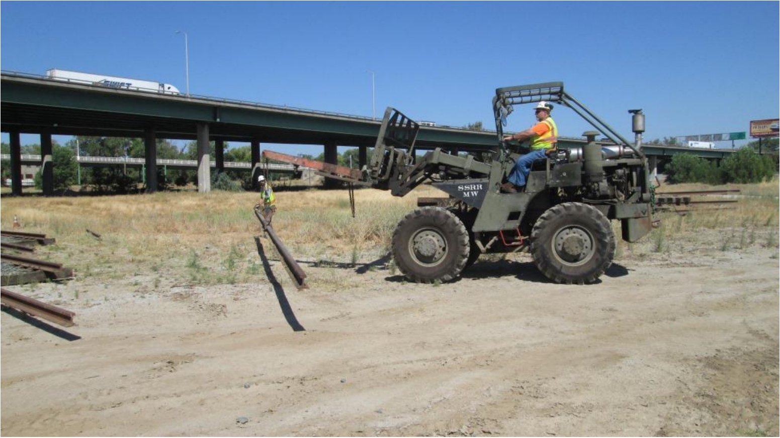
Matt guides the loose rail...