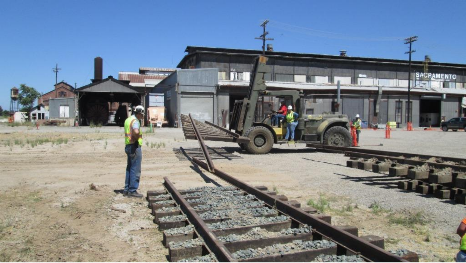
Simba brings in the next panel