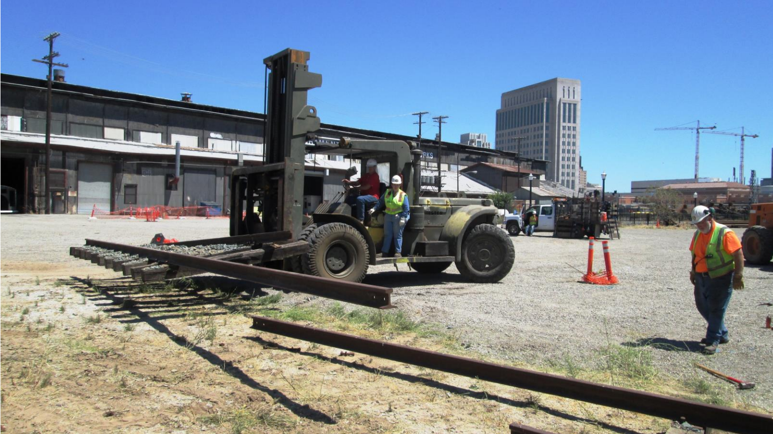
Leonard brings in Simba!