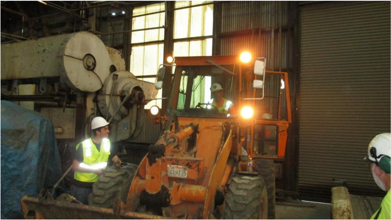
Lights! Loader! Action!