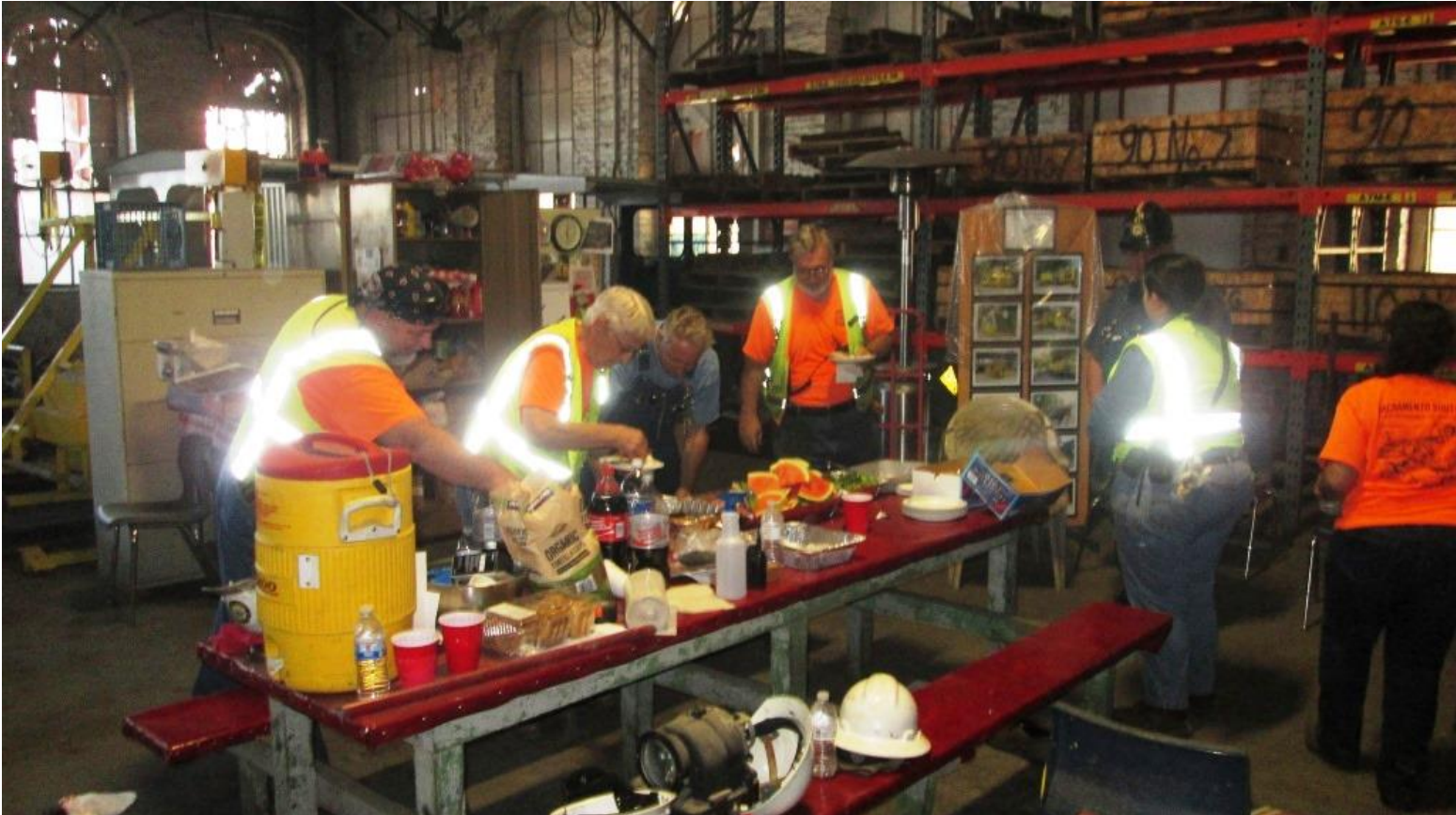
The Team simply shines with excitement over the prospect of burgers, watermelon, and cookies!