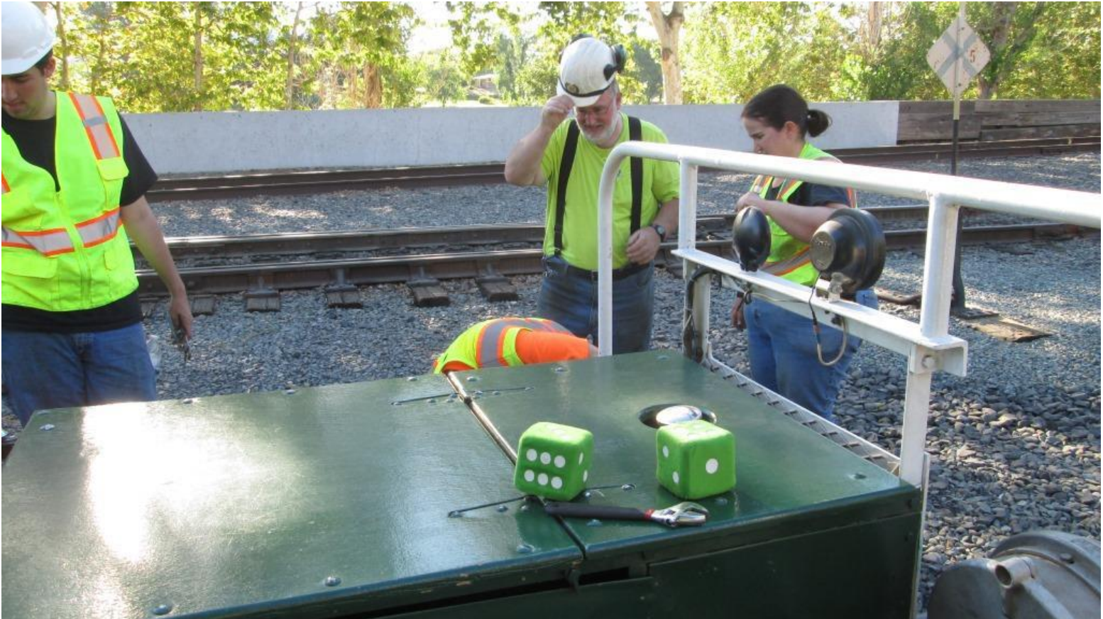
There was a casualty of this operation: the motorcar's signature fuzzy-dice...