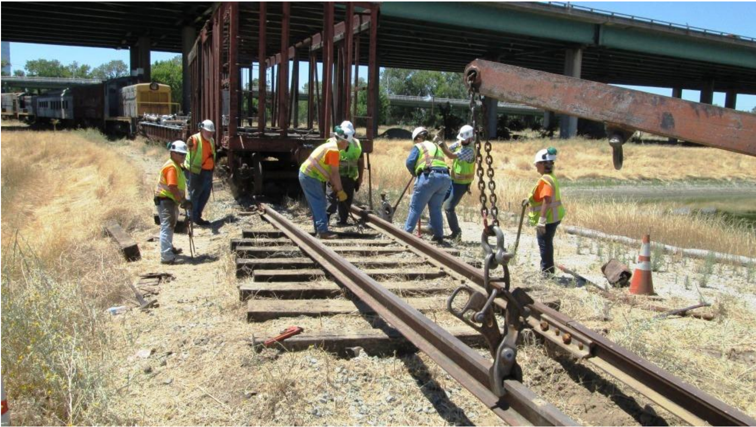
The Green Machine holds up one rail as the Team uses jacks to adjust the elevation of the other