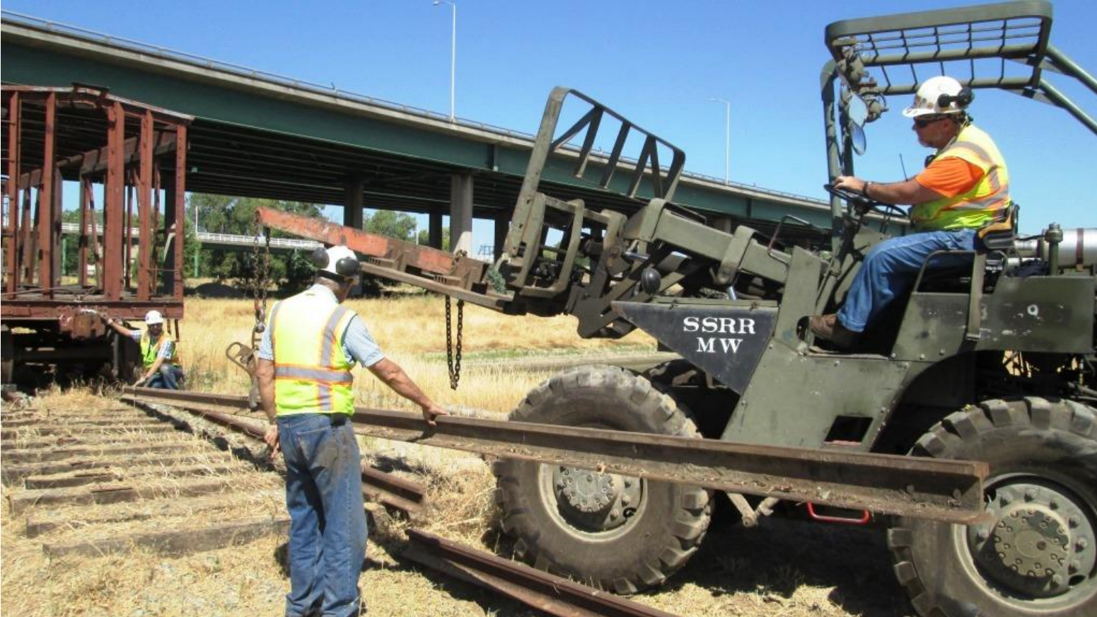
...And directs it into position