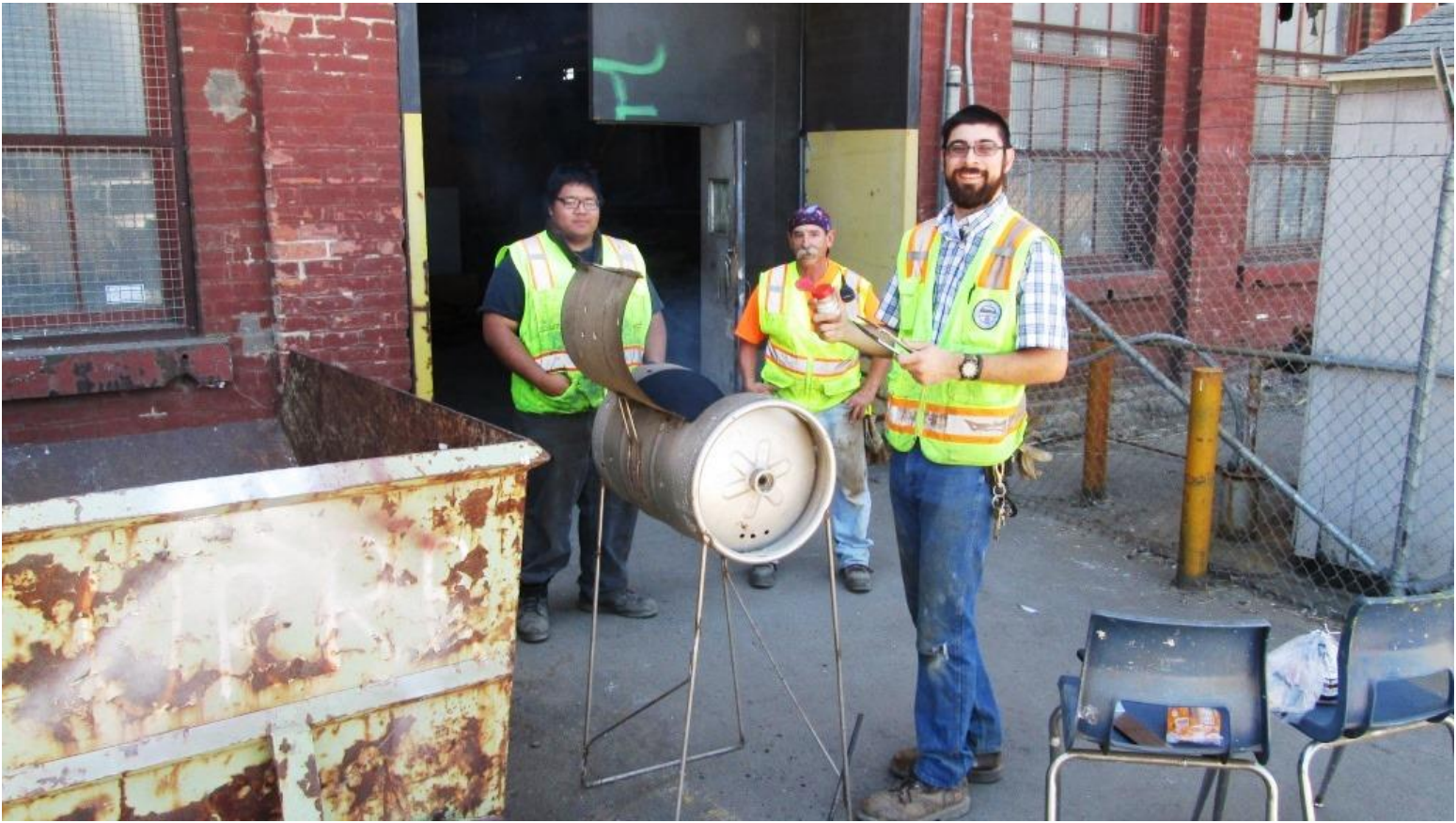
Barbecue lunch outside the Erecting Shop!