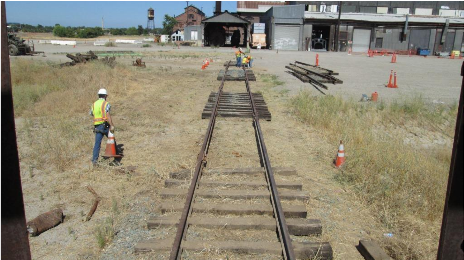
By day's end, we had 156 feet of track laid