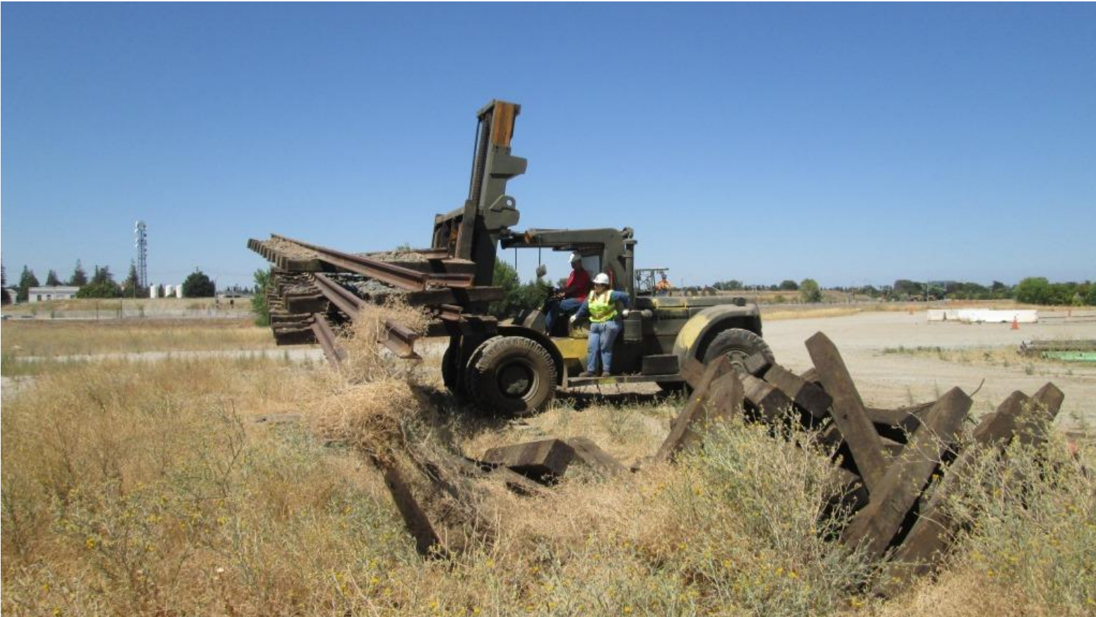
Simba can lift three panels of track at once whereas it took both the loader and Green Machine to lift one...